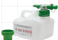
Jerry Can, Safety Spout & e-NRG bottle adaptor