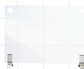
Plamsa Fire Screen