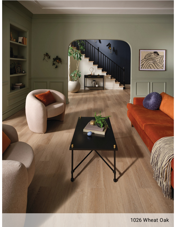
1026 Wheat Oak