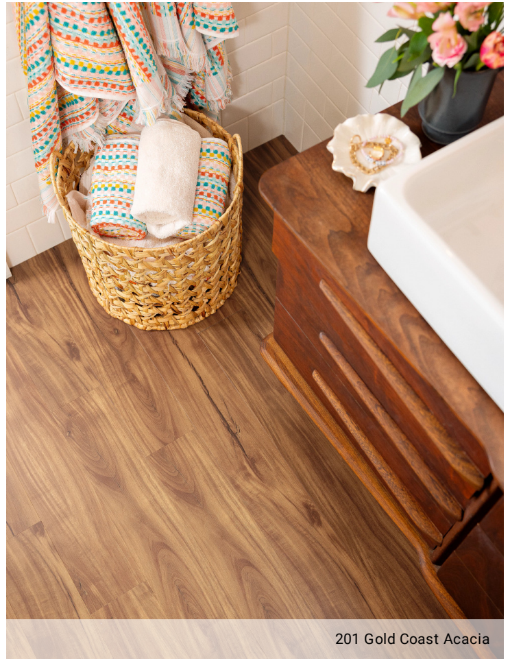
201 Gold Coast Acacia