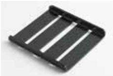
Joining Buckle Black JBBK-4