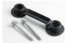
90 deg Inside Corner Insulated Bracket Black & M12 x 120 Galv Coach Screw & Washer IB90BK-4 & M12x120