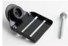
Pre Bent 45 deg Attaching Insulated Buckle Black & M12 x 120 Galv Coach Screw & Washer IABBK-445 & M12x120