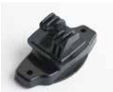
Claw Insulator Black CIB