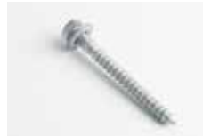
M12 x 120 Galv Coach Screw & Washer M12x120