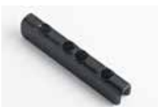
Joining Buckle Hot Cote Black CWJBBK