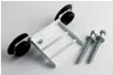
Fixed Insulated T-Buckle & M12 x 120 Galv Coach Screw & Washer ITBW-4 & M12x120