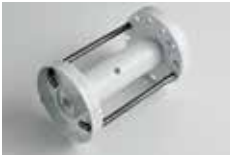
Tensioning Spooler White IB90TBK-4