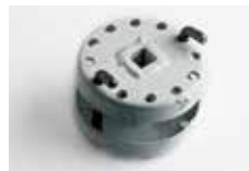
Donut Tensioner Hot Cote White DTW