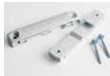
Line Post Insulator Bracket White & Secure Screw RIW-4 & STS