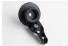
Pre Bent 45 deg Attaching Buckle Hot Cote Black LCABBK-45