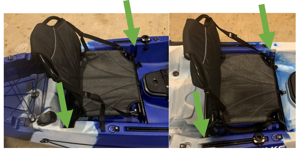
Insert the forward and back seats as per the above. There are specific slots for each of the seats to secure them from moving around during paddling.

Start by threading the two side straps that hold the seat back upright on both side through. Secure them enough that the seat is upright and then leave them to adjust once you're on the water and can get a better feel for the right angle of the seat to suit your paddling style.