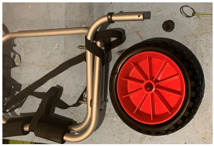
Your kayak trolley should come disassembled as per the above. With the main frame, 2 x wheels, 2 x black locking nuts, 2 x locking pins and 1 x kayak strap.