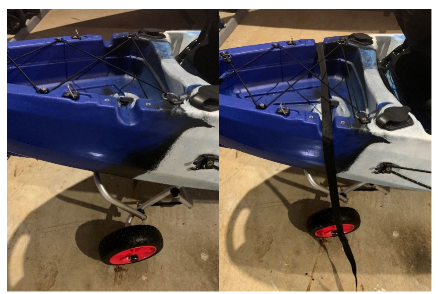
When using your kayak trolley we recommend putting it under your kayak as above. Then weave the securing strap through the trolling motor mount recess as so.

Push the locking pin through the aligned holes (orange arrow) and flip the ring over so it locks the pin in place (purple arrow). Now you've completed one wheel, repeat the actions for the second wheel.