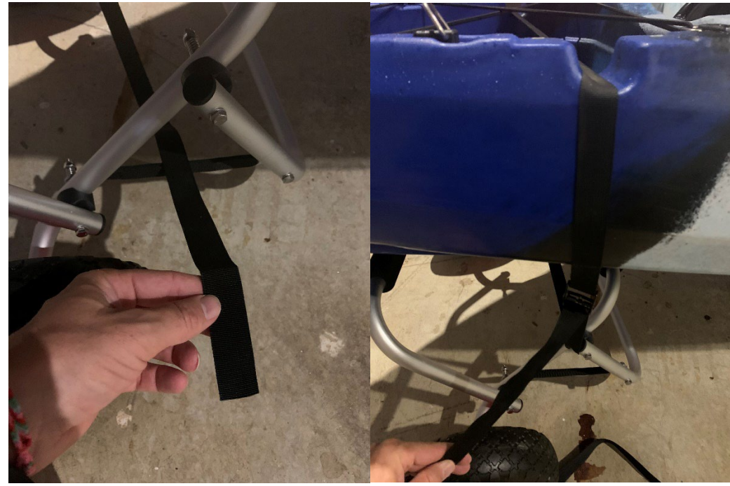
Run the strap through the lower arm section and cinch it through the buckle and tighten.