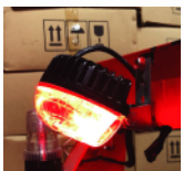
ARC LIGHT ANGLE