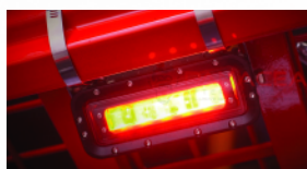
2 ZONE LIGHTS' ANGLE