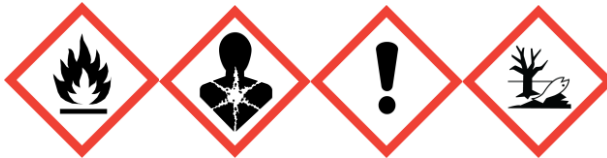
Flame Health Hazard Irritant Aquatic Hazard