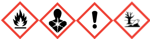
Flame Health Hazard Irritant Aquatic Toxicity