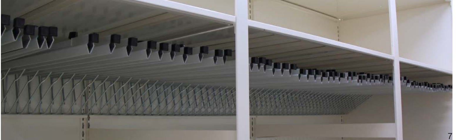
HANGING BLUEPRINT/POSTER/FILE CLAMPS