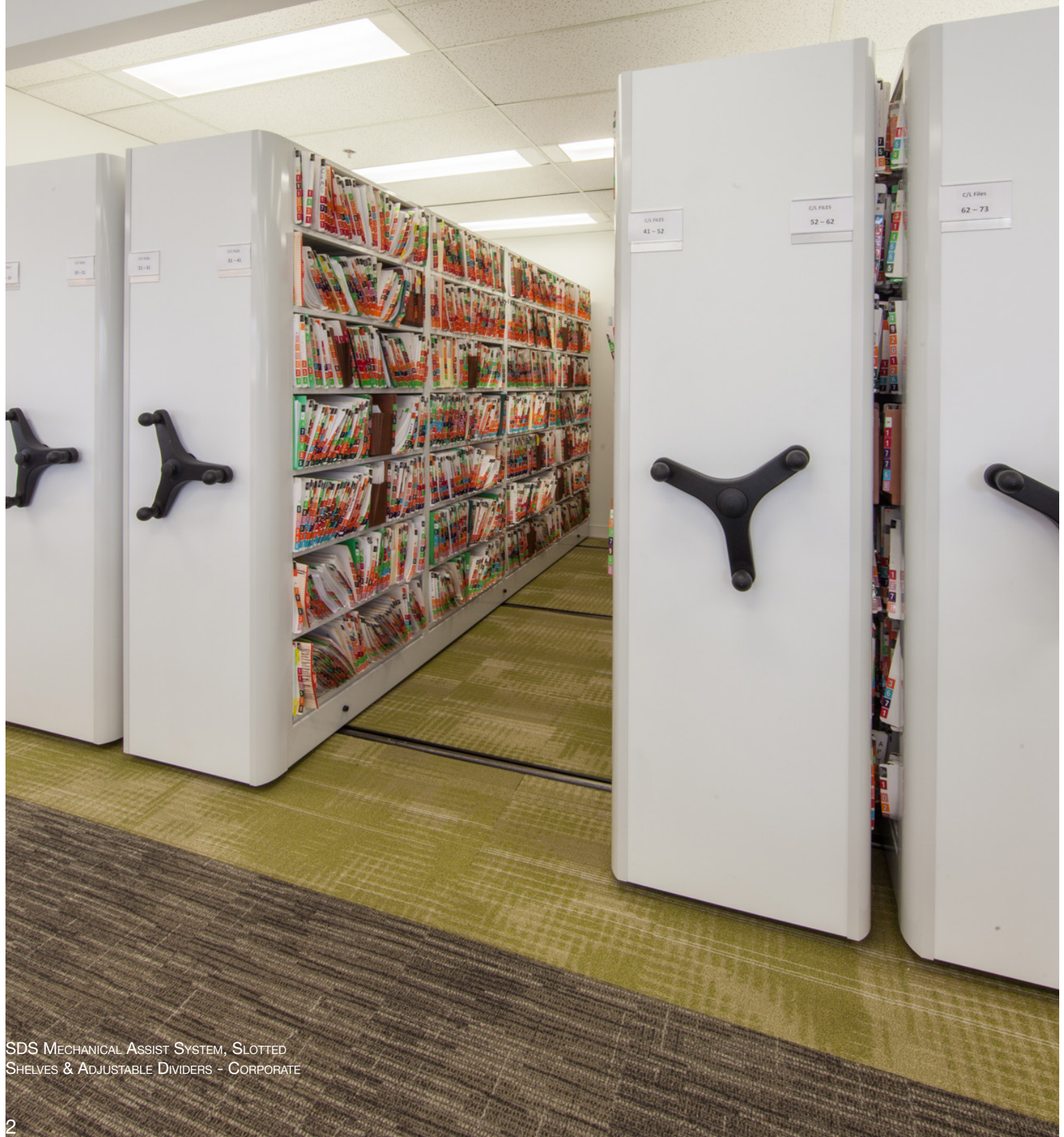
SDS MECHANICAL ASSIST SYSTEM, SLOTTED SHELVES & ADJUSTABLE DIVIDERS - CORPORATE