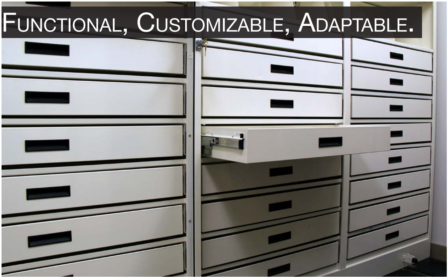
CUSTOM PULL-OUT DRAWERS - ACCESSORY STORAGE - PUBLIC HEALTH & SAFETY