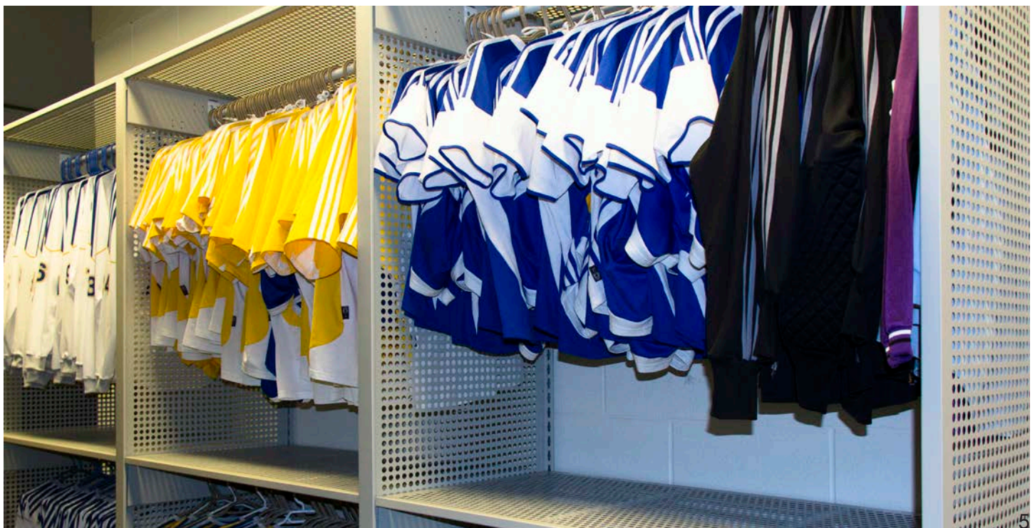
PERFORATED STEEL SHELVES & UPRIGHTS, HANGING RODS - ATHLETIC