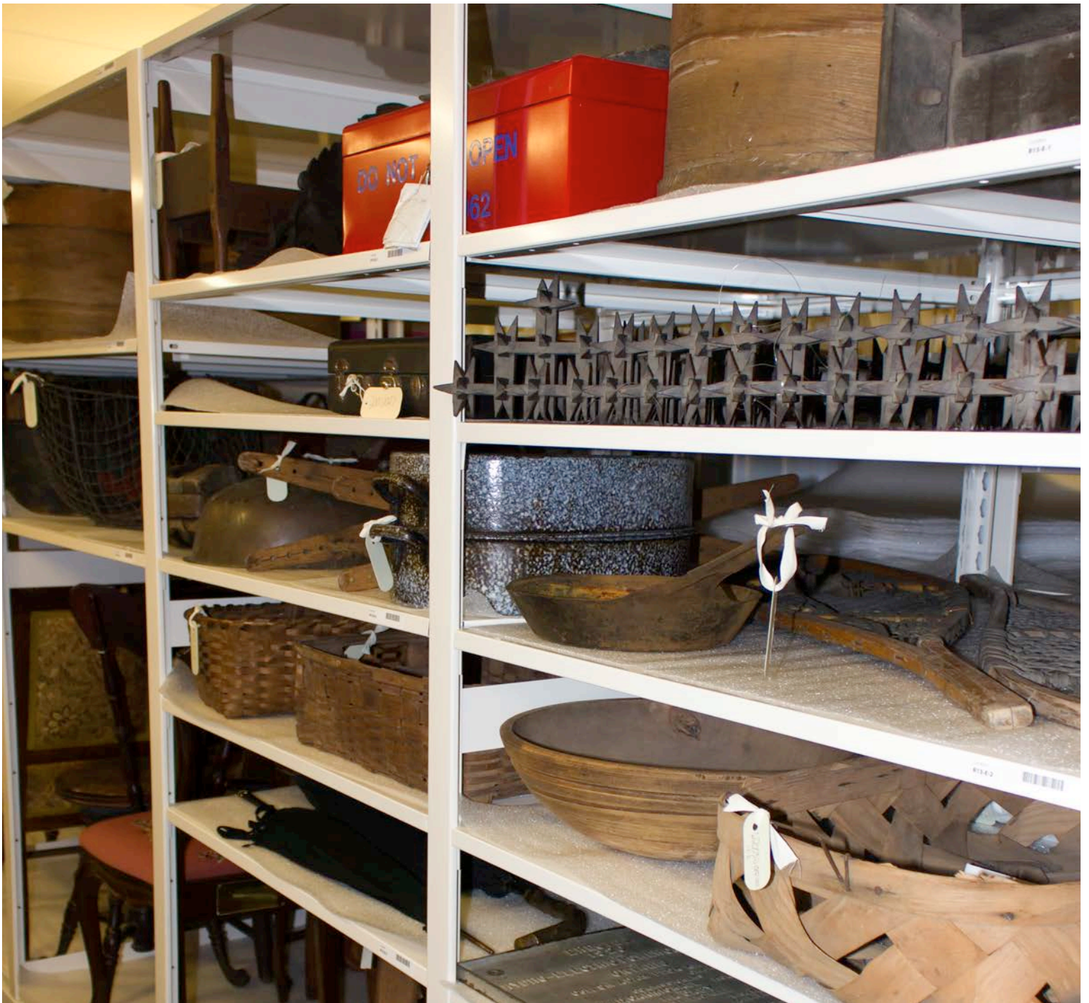
UNSLOTTED HEAVY DUTY STEEL SHELVES - MUSEUM