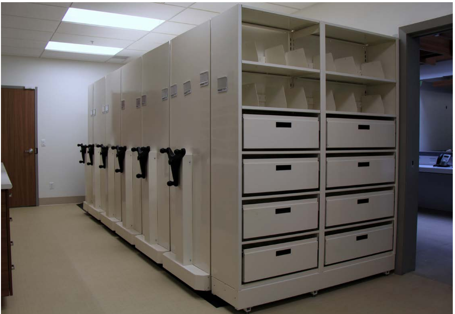
SDS MECHANICAL ASSIST SYSTEM, SLOTTED SHELVES & ADJUSTABLE DIVIDERS, PULL-OUT DRAWERS - CORPORATE