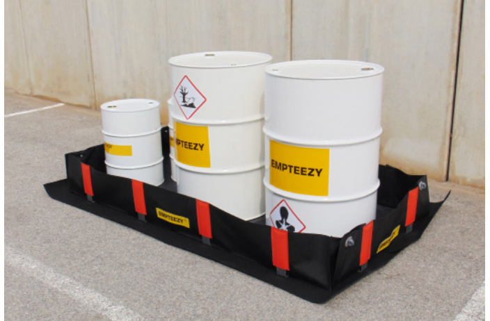
EB2 + EB2M pictured (EB2M sold separately)

Our PVC portable bunds are easy to store and transport, quick to assemble and are compatible with hydrocarbons and a wide range of chemicals (compatibility information available upon request). These portable bunds are the ideal solution to your containment needs when a standard spill pallet is impractical.