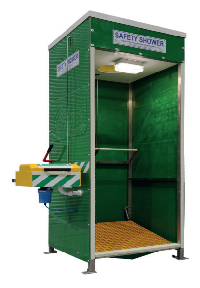
Shown with optional foot platform