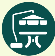
Decks & Patio