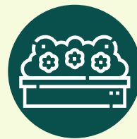
Mulched Flower Beds