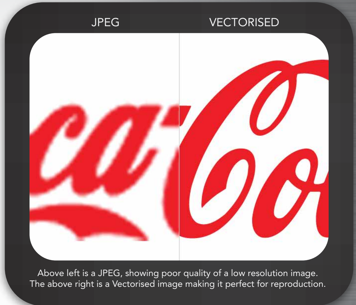
Above left is a JPEG, showing poor quality of a low resolution image. The above right is a Vectorised image making it perfect for reproduction.

We offer a printing service from £1.50 for numbers, £2.00 for names and between £2.50 - £4.50 for sponsor logo's. Please note that prices may vary depending on size and colour. Prices stated are meant as a guide only.