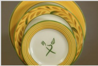
Example of Crests Caridad Kitchen, Southern Arizona Food Bank