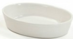
Oval Baker, 16 oz #96 (7 1/4" x 5 1/4" x 1 5/8")