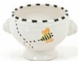
Lions Head Compote, 16 oz #137 (3 1/2" x 4 3/8")