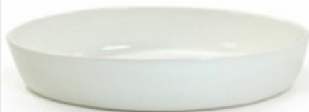
Lasagne Casserole, 184 oz #4016 (16 1/4" x 11" x 3 1/8")