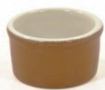
Ramekin, Plain, Rolled Edge, 6 oz #154 (3 7/8" x 1 3/4")