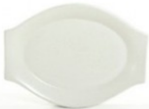
Handled Platter #120 (12 5/8" x 9 1/2")