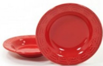
Aztec Rim Soup Bowl, 12 OZ #2438 (9 3/4")