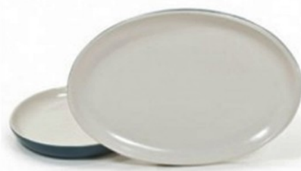
Couped Oval Platter #6049 (12 1/2" x 8 7/8")