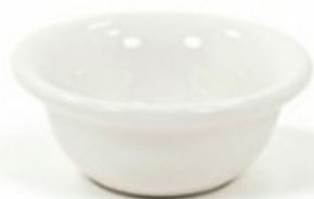
Pot Pie, 8 oz #101 (5 3/16" x 2")