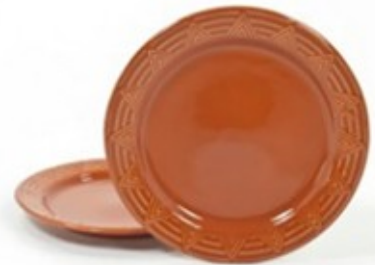
Aztec 12" Plate #2412 (12")