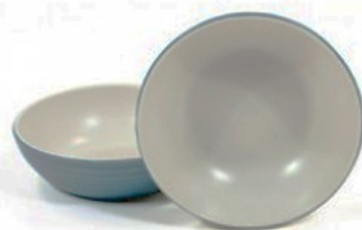
Couped Round Bowl, 42 OZ #6081 (8 1/8" x 2 1/4")