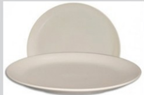
Tape Rim Plate, 12 7/8" #1612, MOQ 144 (12 7/8") Matte White