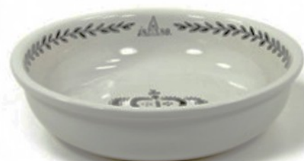
Abondanza Plus Bowl, 196 oz #496 (13 1/4" x 3 1/2")