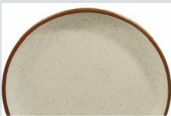
Example of Bands Della Terra