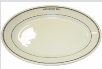
Example of Bands South Beverly Grill