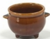
Tripod Kettle, 8 oz