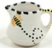
Duquesne Creamer, 3 oz #160 (3 1/8" x 2 3/4")