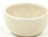
Unhandled Casserole, 5.5 oz #230-1 (3 3/4" x 1 3/4")