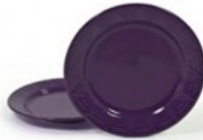
Aztec 8 1/2" Plate #2406 (8 1/2")