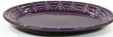
Aztec 10 5/8" Platter #2447 (10 5/8" x 7 3/8")