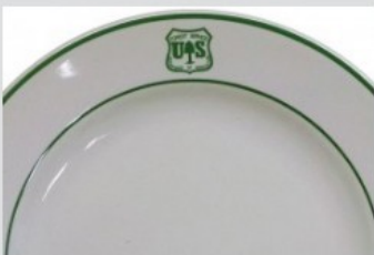
Example of Bands U.S. Forest Service