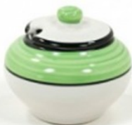
Plaza Sugar w/lid, 8 oz #31-0 (4" x 3 1/2")