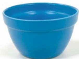
Buffet Bowl, 168 oz #1808 (10 1/4")