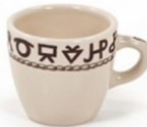
Buckaroo Cup, 6 oz #1836 (3" x 3 1/2")