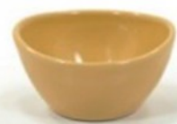
Salsa Cup, 5 oz #241 (3 5/8" x 3 1/4" x 1 5/8")