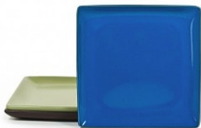
Entrée Plate #2647 (9 1/2" x 6")