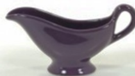
Sauce Boat, 6 oz #36