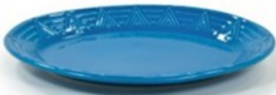
Aztec 12 1/2" Platter #2449 (12 1/2" x 8 7/8")