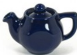
Flat Sided Teapot, 12 oz #26-0 (6 3/8" x 3 1/4" x 4 1/4")