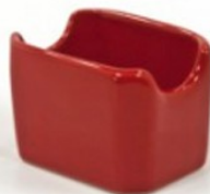
Packaged Sugar #258 (3 3/8" x 2 5/8" x 2 1/4")