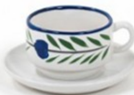
Latte Stackable, 9 oz #1873 (2 1/4" x 3 1/4")