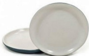
Couped Plate, 6 1/2" #6004 (6 1/2")