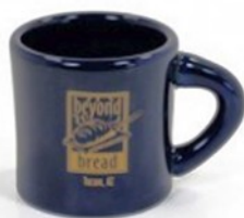
Navy Mug, 10 oz #1862 (3 1/2" x 3 1/2")