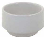
Stackable Bowl, 9 oz #1873UN (2 1/4 x 3 3/4")