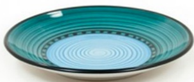
Tara Bowl, 48 oz