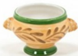
Lions Head Compote, 8 oz #136 (2 5/8" x 3 1/2")