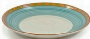
Bonnie Bowl, 72 oz