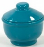
Large Sugar Bowl, Lid, 14 oz #29-0 (4 5/8" x 3")