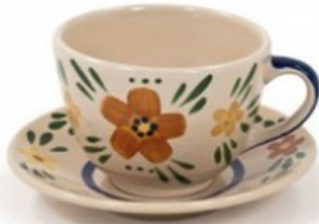
Soup Cup / Saucer Cappuccino, 18 oz #821 (3 1/2" x 4 3/4")