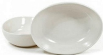
Couped Oval Bowl, 32 oz #6044 (8 3/8" x 6 1/2" x 2 1/4")