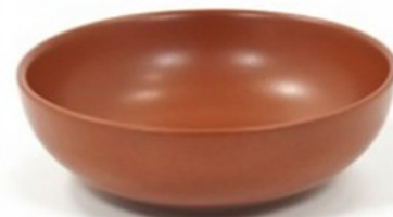
Princeton Salad Bowl, 64 OZ #82 (9 5/8" x 3 1/4")