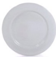
Wide Rim Plate, 10 1/2"