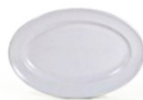
Wide Rim Platter