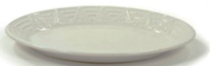
Aztec 13 3/4" Platter #2450 (13 3/4" x 9 1/4")