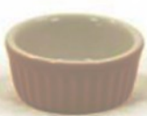
Ramekin, Fluted, 2 oz #151F (2 5/8" x 1 1/8")