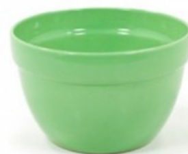
Buffet Bowl, 112 oz #1806 (8 1/2")