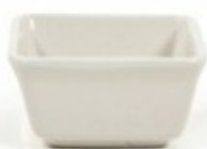
Square Bowl, 20 oz #2636 (5 3/8" x 5 3/8" x 2 5/8")