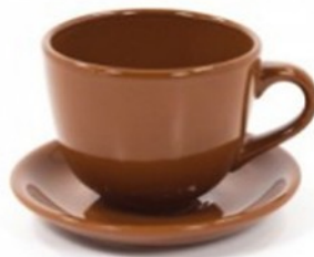
Corona Cup, Saucer #825 (3 1/2" x 4 1/4")