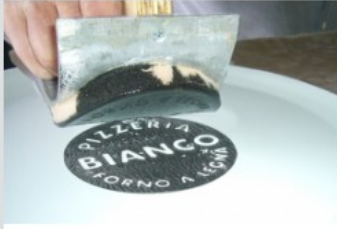
Example Bianco's Pizza Platter