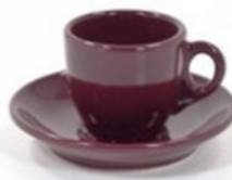
Saucer for Espresso Cup #2796 (4 1/4")