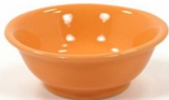
Footed Salad Bowl, 32 oz #79 (8 1/4" x 2 7/8")