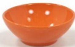
Georgian Salad Bowl, 22 OZ #86 (6 1/2" x 2 1/2")