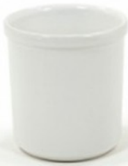
Bain Marie Jar, 1 Qt #134 (5" x 5 1/2")