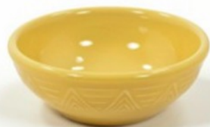
Aztec Nappy Bowl, 15 oz #2435 (6")