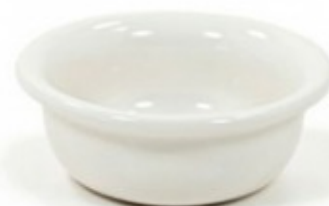
Pot Pie, 14 oz #102 (6" x 2 1/2")