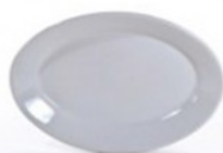
Wide Rim Platter #1949 (12 1/2" x 8 7/8")