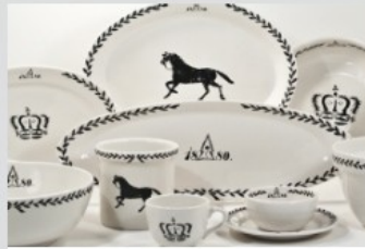
Example of Crests Alice Goldsmith