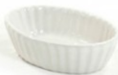
Small Souffle, 9 oz #852 (5 1/2" x 4" x 1 1/2")