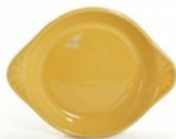
Round Welsh Rarebit, 9 OZ #70 (6" x 1")