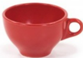
Double Latte Cup, 13oz #1879 (3 3/4" x 4")