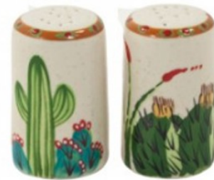
Small Salt & Pepper Shakers #18 (3 1/4 x 2")