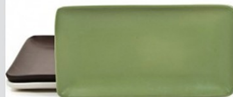
Long Track #2649 (11 9/16" x 6 1/4")