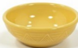
Aztec Nappy Bowl, 15 oz #2435 (6")