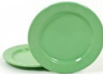
Aztec 10 1/2" Plate #2410 (10 1/2")