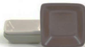
Lamekin 4 oz #2641 (4 1/16" x 4 1/16")