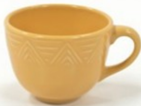
Aztec Corona Cup, 14 oz #2461 (4 3/4" x 3 3/8")