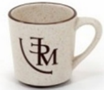
Barron Mug, 6.5 oz #1880 (3 1/2" x 3 1/4")