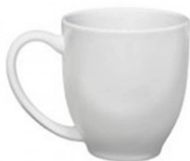
Bistro, 16 oz #1883 (4 7/16" x 4 1/4")