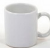
Straight Sided Espresso, 2 oz #1867 (2 1/2" x 2 1/8")