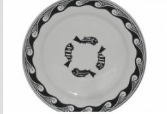
Example Mimbreno Buffet Plate