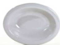
Serving Bowl, 46 oz