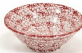
Footed Salad Bowl, 16 oz #85 (6 1/4" x 2 1/4")