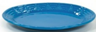
Aztec 12 1/2" Platter #2449 (12 1/2" x 8 7/8")