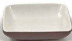
Square 10 oz #2638 (5 1/2" x 5 1/2" x 1 1/4")