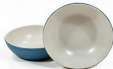
Couped Round Bowl, 42 OZ #6081 (8 1/8" x 2 1/4")