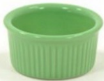
Ramekin, Fluted, 6 oz #154F (3 5/8" x 2")