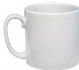
New York Mug, 14 OZ #1885 (3 3/4" x 3 7/8")