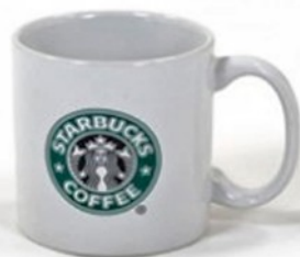
C Handle Mug, 20 OZ #822 (4 1/4" x 4")