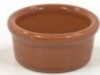
Ramekin, Plain, Rolled Edge, 2.5 oz #152 (3" x 1 3/8")