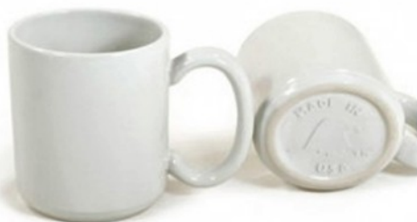
El Jefe Mug, 15 oz #1864 (4 1/2" x 3 1/2")