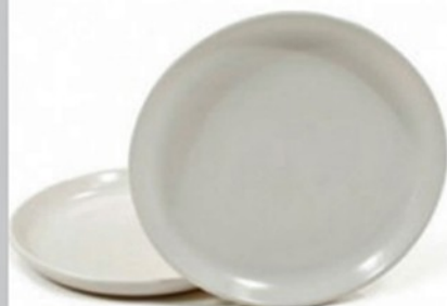
Couped Plate, 9 1/2 x 1" #6008 (9 1/2")