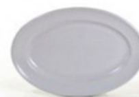
Wide Rim Platter #5949 (12 3/4" x 9")