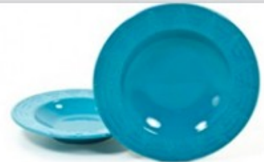
Aztec Pasta Bowl, 19 oz #2412DW (11 1/4")