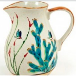
Water Pitcher, 72 oz #196 (8 1/2" x 9")