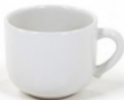
WW Mug, 20 oz #823 (4 1/4" x 3 5/8")