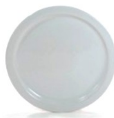
Wide Rim Plate, 13 3/8"