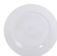
Wide Rim Plate, 10 1/4"