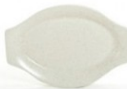
Handled Platter #115 (10 3/8" x 3 7/8")