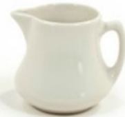
Duquesne Creamer, 6 oz #162 (3 3/4" x 3 3/8")