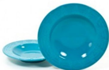
Aztec Pasta Bowl, 19 oz #2412DW (11 1/4")