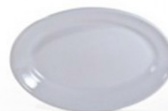
Wide Rim Platter #1956 (15 3/4" x 10 5/8")