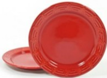
Aztec 9 3/4" Plate #2408 (9 3/4")