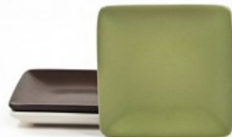
Bread & Butter #2643 (6 3/16" x 6 3/16")