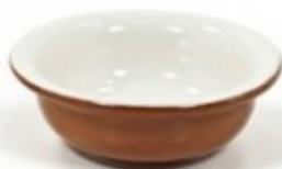
Pot Pie, 5 oz #100 (4 1/2" x 1 1/2")