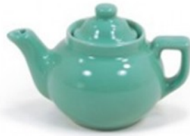
Boston Teapot, 20 oz #22-0 (7" x 4 1/2" x 4 1/2")