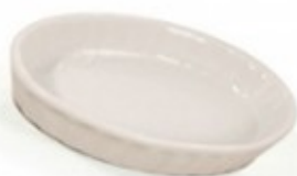
Fluted Souffle, 6 oz #2326 (6" x 4 1/4" x 1")