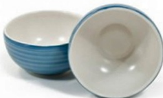
Couped Small Bowl, 7oz #88 (3 7/8")