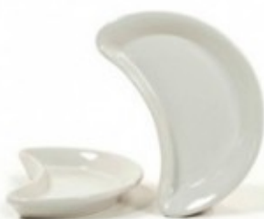
Crescent Dish 10 oz #1640 (8 1/4" x 4 3/4")