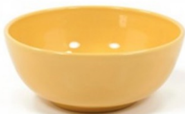
Mixing Bowl, 160 oz #1811 (11")