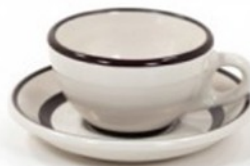
Coffee Cup, 6 oz #2793 (2 1/2" x 4")