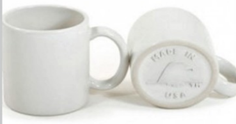
Chandler Mug, 11 OZ #1856 (3 3/4" x 3 1/8")