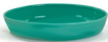
Lasagne Casserole 102oz 4015 14" x 9 1/2" x 2 5/8"