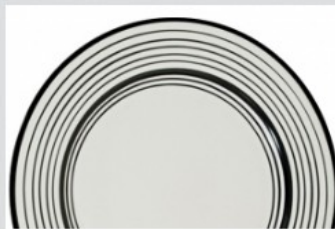
Example of Bands Tuxedo