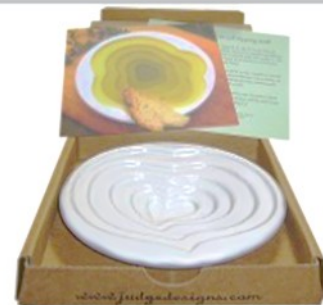
Heart Olive Oil dish, 1.75 OZ #mj heart (4 3/4")