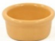
Ramekin, Plain, Rolled Edge, 4 oz #153 (3 1/2" x 1 5/8")