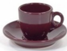
Espresso Cup, 3 oz #2795 (2 1/4" x 2 1/2")