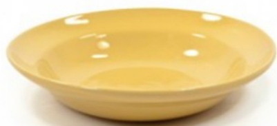
Serving Bowl, 90 oz #4005 (12 1/4" x 2 1/2")