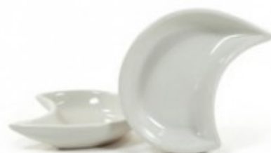
Crescent Dish 6 oz #1641 (6 3/4" x 5 7/8" x 1 1/4")