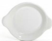
Round Welsh Rarebit, 6 oz Item #69 (5 1/4" x 7/8")