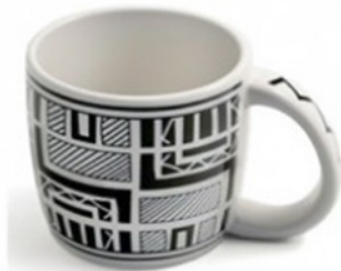
Puebloan Mug 14 oz #1916 Canyons