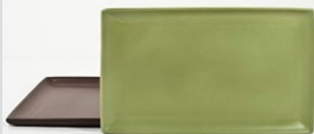
Pizza Plate #2651 (14 1/16" x 9 1/16")