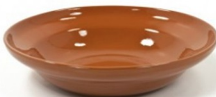
Serving Bowl, 152 oz #4006 (14 3/4" x 3")