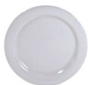
Wide Rim Plate, 12"