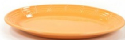
Aztec 15 3/8" Platter #2456 (15 3/8" x 10 5/8")