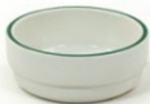
Soup/Cereal, 10 oz #2374 (4 3/4" x 1 3/4")