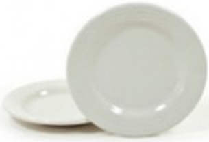
Aztec 7 1/8" Plate #2405 (7 1/8")