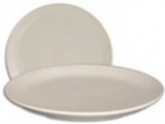
Taper Rim Plate, 7 1/8" #1605 (7 1/8") Matte White