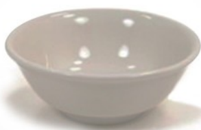
Footed Salad Bowl, 36 oz #83 (8 5/8" x 3 1/2")