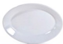
Wide Rim Platter