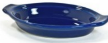
Welsh Rarebit, Oval 12 oz #73 (9 1/2" x 4 3/4" x 1")