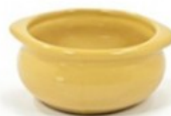
Onion Soup Crock, 12 oz #127 (5 1/8" x 2 1/4")