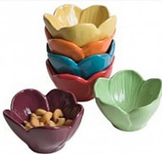
Cactus Blossom Bowl, 5oz #35, 4 1/4" x 2 3/8" red, buttercup, tangerine, pistachio, turquoise, eggplant