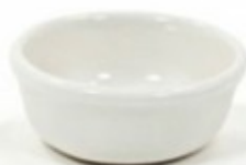
Cocotte, 5 oz #106 (4" x 1 5/8")