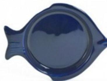
Fish Platter #114 (12" x 9 1/2" x 1 1/8")