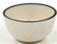
Chinese Rice Bowl, 8 oz #38 (4 1/8" x 3 3/4")