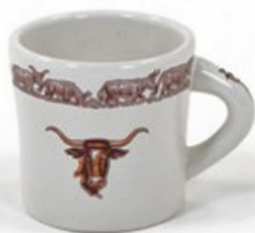
Texas Mug, 14 oz #1877 (3 3/4" x 4")