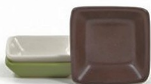
Lamekin 4 oz #2641 (4 1/16" x 4 1/16")