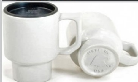
Travel Mug, 17 oz #5006 (5" x 3 1/2")