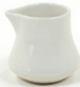
Unhandled Duquesne Creamer, 12 oz #163-s (3 7/8" x 4")