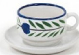
Saucer (for Latte Stackable) #1874 (6")