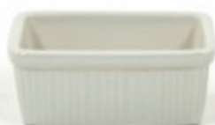
Fluted Packaged Sugar #254 (4 3/4" x 3" x 2")