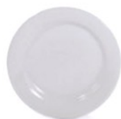
Wide Rim Plate, 9"