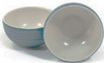
Couped Small Bowl, 7oz #88 (3 7/8")