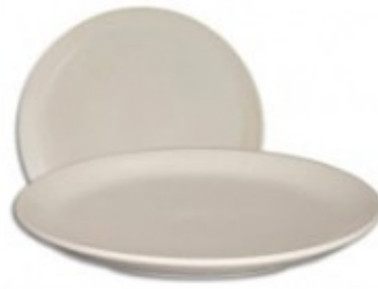
Taper Rim Plate, 8.5" #1606 (8.25") Matte White