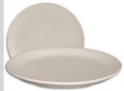
Taper Rim Plate, 10.5" #1610 (10.5") Matte White