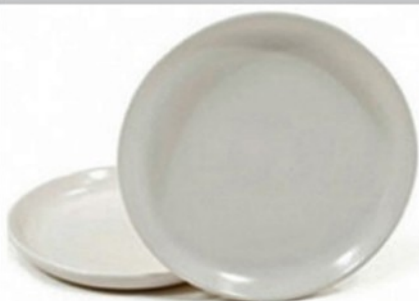
Couped Plate, 10 1/2 x 1" #6010 (10 1/2")