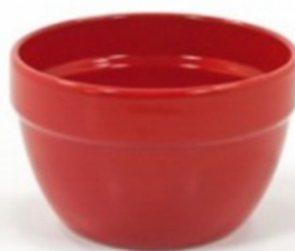
Buffet Bowl, 68 oz #1803 (5 1/2")