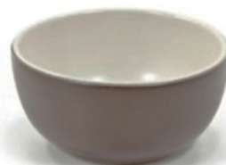
Chili Bowl, 15 oz