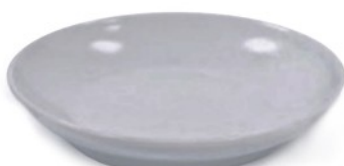
Scarlett Bowl, 30 oz