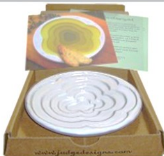
Cloud Olive Oil dish, 1.75 OZ #mj cloud (4 3/4")