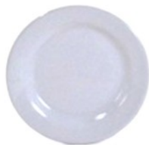
Wide Rim Plate, 6 1/8"