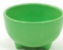
Three Legged Salsa, 14 oz