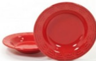
Aztec Rim Soup Bowl, 12 oz #2438 (9 3/4")