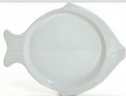
Fish Platter #214 (14")