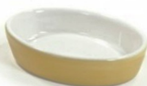
Oval Baker, 10 oz #95 (6 1/2" x 5" x 1 3/8")