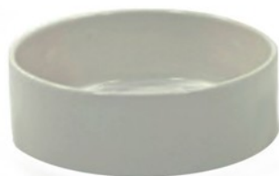
Pet Bowl, 48 oz #54 (7 5/8" x 2 7/8")