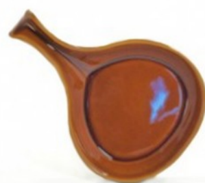
Frypan Server, 18 oz #2347 (11 5/8" x 8 1/8" x 1 3/8")