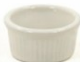
Ramekin, Fluted, Rolled Edge, 2.5 oz #152F (3" x 1 3/8")