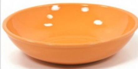
Abondanza Bowl, 100 oz #486 (12 1/2" x 3 1/4")