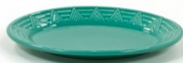
Aztec 12" Platter #2448 (12" x 8 1/4")