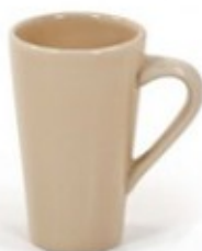
Tall Espresso Mug, 5 oz #tall espresso (4 1/8" x 2 1/2")