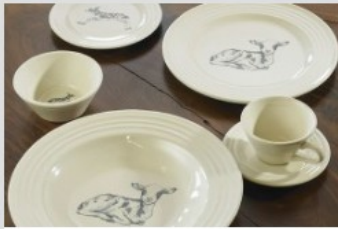
Example of Crests Lamb Farm Kitchen