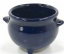
Tripod Kettle, 12 oz