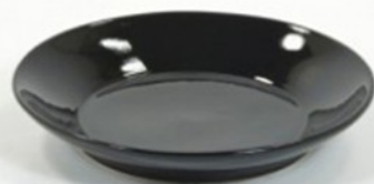
Rhett Bowl, 23 oz