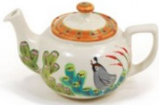
Boston Teapot, 14 oz #10-0

www.hfcoors.com 800-782-6677 or 520-903-1010