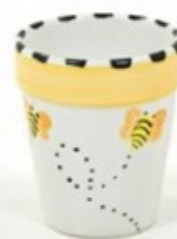
Unhandled Flower Pot Mug, 14 oz #1872UN (4 1/4" x 3 1/4")