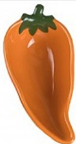
Chili Pepper Dipping Dish, Tangerine, 4oz #34, tangerine 6" x 3 x 2"