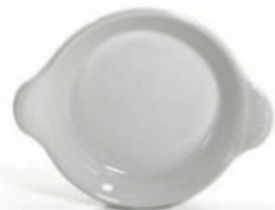
Round Welsh Rarebit, 12 OZ #71 (6 3/4" x 1 1/8")