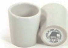
Shot Glass, 2 oz #702UN (2 1/2" x 2 1/8")