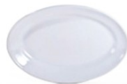
Wide Rim Platter