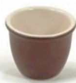
Custard, 4 oz #141 (3" x 2 3/8")