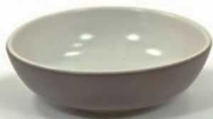
Princeton Salad Bowl, 26 OZ #80 (7 3/8" x 2 1/8")