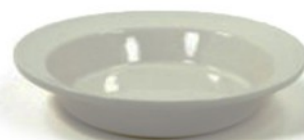
Pasta Bowl, 24 oz #1910DW (10 1/2")