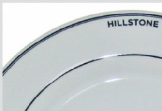
Example of Bands Hillstone Restaurants