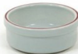
Soup/Cereal, 10 oz #2372 (4 3/4" x 1 3/4")