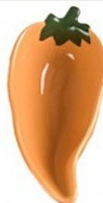
Chili Pepper Dipping Dish, Mango, 4oz #34, mango 6" x 3 x 2"