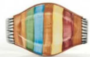
Handled Platter #125 (8 1/2" x 5 5/8")