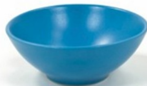
Georgian Salad Bowl, 28 OZ #87 (7 1/4" x 2 7/8")