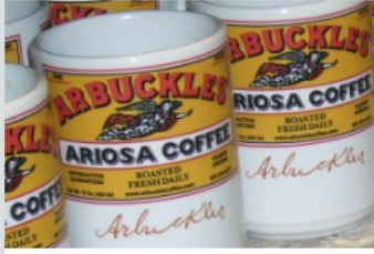
Example Arbuckle Coffee Mug