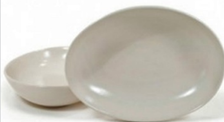
Couped Oval Bowl, 42 oz #6046 (10 1/2" x 7 7/8" x 2 1/4")