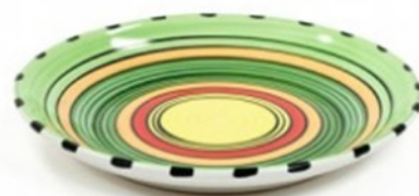
Butler Bowl, 48 oz