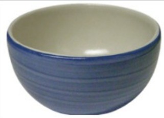
Blue Hand Painted Blue / Matte White