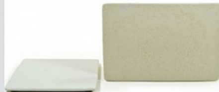
Rectangular Canape Plate #2847 (10 1/2" x 7 7/8")