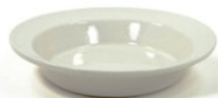
Pasta Bowl, 24 oz