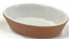
Oval Baker, 6 oz #94.5 (5 1/2" x 3 7/8" x 1 1/8")