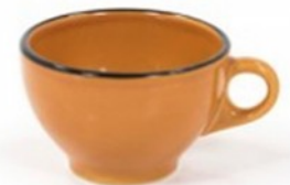
New Latte Cup, 9 OZ (2 5/8" x 4") #1878