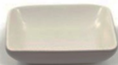
Square 10 oz #2638 (5 1/2" x 5 1/2" x 1 1/4")