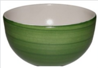
Green Hand Painted Green / Matte White