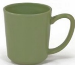
Seattle Mug, 14 oz #827 (3 1/2" x 4 5/8")