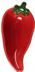
Chili Pepper Dipping Dish, Red, 4oz #34 red, 6" x 3 x 2"