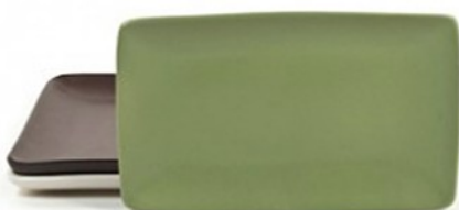
Short Track #2645 (9 1/2" x 6")