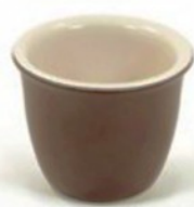
Custard, 6 oz #143 (3 1/2" x 2 3/4")