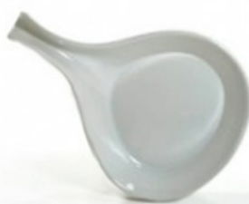
Frypan Server, 12 oz #2346 (10 1/2" x 7 3/8" x 1 1/4")