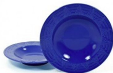
Aztec Pasta Bowl, 30 oz #2413DW (12")