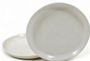
Couped Plate, 8 1/4" #6006 (8 1/4")