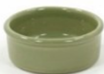
Soup/Cereal, Rolled Edge 10 oz #2372R (4 3/4" x 1 3/4")