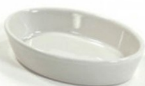
Oval Baker, 8 oz #94 (6 1/4" x 4 1/2" x 1 1/4")