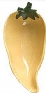
Chili Pepper Dipping Dish, Butternut, 4oz #34, butternut 6" x 3 x 2"