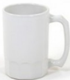
Varsity Mug, 15 oz #1865 (4 1/2" x 3 1/2")