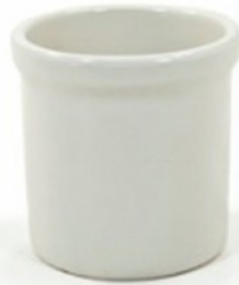
Bain Marie Jar, 2.5 Qt #135 (6 1/2" x 7 1/4")