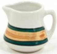
Duquesne Creamer, 4.5 OZ #161 (3" x 3")