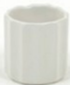
Paneled Sugar, 3 oz #32-1 (2 3/8" x 2 1/4")