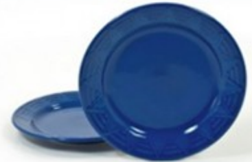
Aztec 9" Plate #2407 (9")