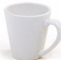
Conical Mug, 13 oz #1881 (4" x 3 3/4")