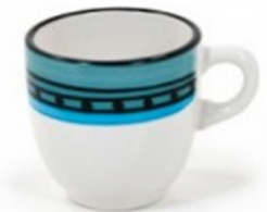
Admiral Cup, 10 oz #1852 (3 1/2" x 3 1/2")