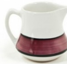
Duquesne Creamer, 12 OZ #163 (3 7/8" x 4")