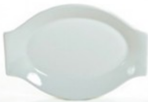
Handled Platter #116 (11 5/8" x 8 5/16")