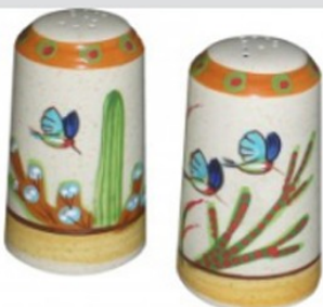
Large Salt & Pepper Shakers #19 (5 3/8 x 2 5/8")