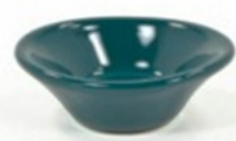
Jelly Dish, 1.5 oz #104 (3 1/8" x 1 1/8" )