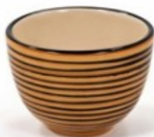
Unhandled Soup / Cappuccino, 18 oz #821UN (3 1/2" x 4 3/4")