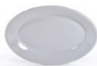
Wide Rim Platter #1948 (12" x 8 1/4")