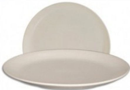
Taper Rim Plate, 11.5" #1611, MOQ 144 (11.5") Matte White