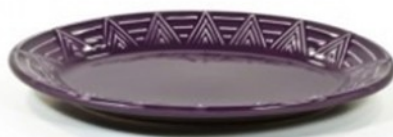
Aztec 10 5/8" Platter #2447 (10 5/8" x 7 3/8")