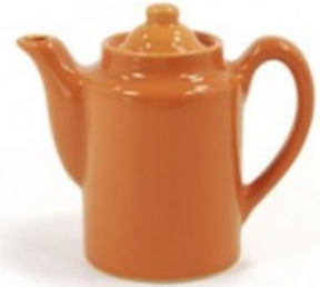
Coffee Pot, 36 oz #63-0 (7" x 4")