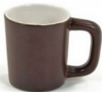
Tucson Mug, 12 oz #1836 (3 1/2" x 4 1/2")