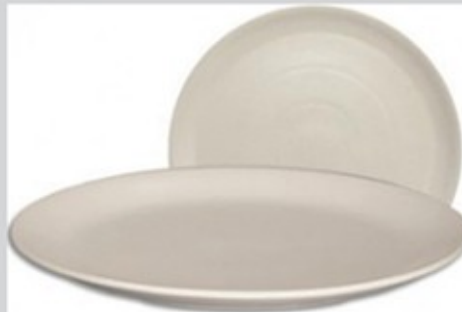
Tape Rim Plate, 12 4/8" #1613-CB, MOQ 144 (12 7/8") Matte White