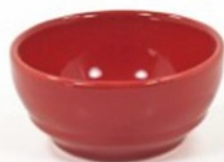
Chili Bowl, 11 oz