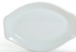
Handled Platter #129 (7 1/2" x 5 1/4")