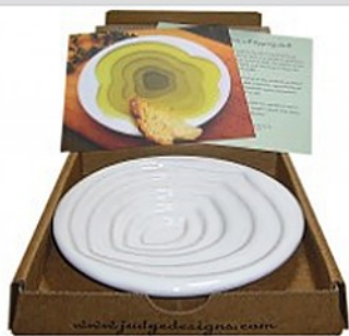
Leaf Olive Oil dish, 1.75 OZ #mj leaf (4 3/4")