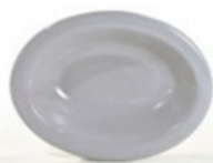
Serving Bowl, 46 oz #1960 (12" x 9 1/4" x 2 1/2")