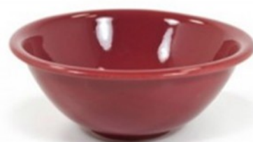
Footed Salad Bowl, 64 oz #84 (10 1/2" x 4")