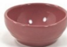
Chili Bowl, 6 oz #90.5 (3 7/8" x 1 7/8")