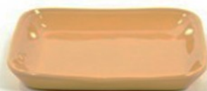
Entrée Plate, 12 oz #2350 (6 3/4" x 6 3/4")