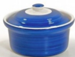
Casserole with Lid, 20 oz #112-0 (6" x 2 3/4")