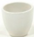
Unhandled Espresso Cup, 3 oz #2795UN (2 1/4" x 2 1/2")