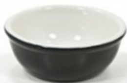
Cocotte, 8 oz #107 (4 3/8" x 1 3/4")