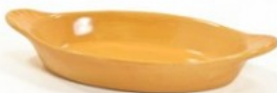
Welsh Rarebit, Oval 17 oz #77 (12 1/2" x 8 7/8")