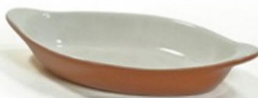
Welsh Rarebit, 15 oz #76 (10 3/8" x 5 1/2" x 1 1/4")