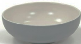
Princeton Salad Bowl, 48 OZ #81 (8 5/8" x 2 3/4")