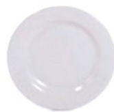
Wide Rim Plate, 7 1/8"