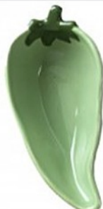
Chili Pepper Dipping Dish, Pistachio, 4oz #34, pistachio 6" x 3 x 2"