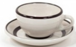
Saucer for Coffee Cup #2794 (5 5/8")