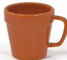
Flower Pot Mug, 14 OZ #1872 (4 3/4" x 3 3/4")