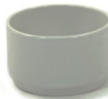
Pet Bowl, 20 oz #52 (4 7/8" x 2 7/8")