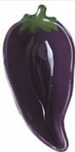
Chili Pepper Dipping Dish, Eggplant, 4oz #34, eggplant 6" x 3 x 2"