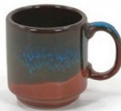
Kierland Stackable Mug, 9 oz #1869 (3 1/4" x 3")