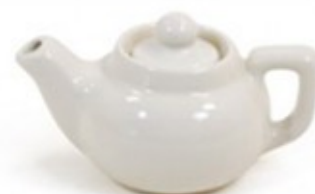
Boston Teapot, 10 oz #21-0 (7 1/4" x 7 1/2" x 3 1/2")