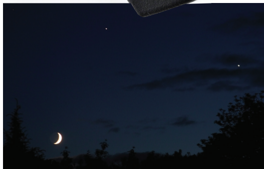
▲ A 1.3-second exposure of the Moon, Venus and Jupiter with a Canon EOS 450D DSLR using half-sidereal tracking

The mount performed well during our tests despite pretty poor skies and very short nights. Our three-minute exposures taken through a 200mm telephoto lens exhibited a small amount