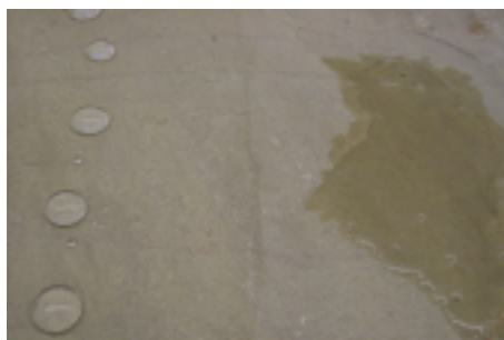
Water applied to natural Indian sandstone paving treated with Clearshield Eco (left) and untreated (right)