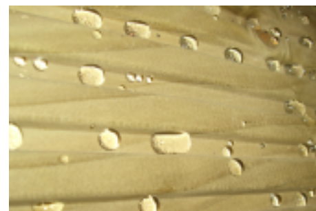
Water applied to decking treated with Clearshield Eco