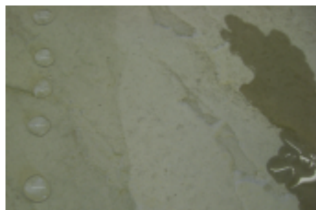
Water applied to precast concrete paving stone treated with Clearshield Eco (left) and untreated (right)