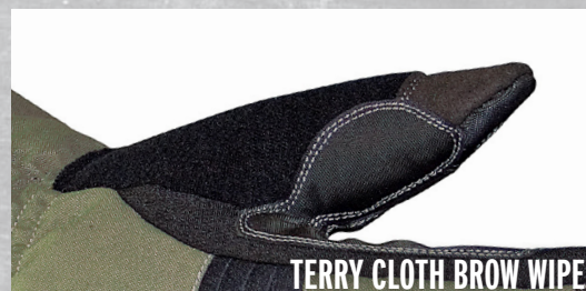
TERRY CLOTH BROW WIPE