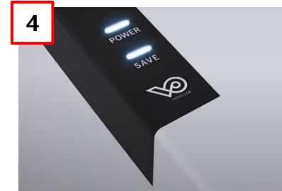
④ Please make sure the LED is solid.