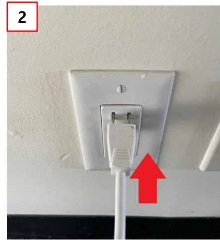
② Plug the cord back