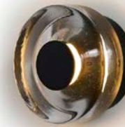
Crystal/Matte Black TAK-PC01-GL01-SH