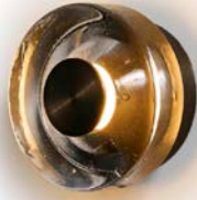
Crystal/Antique Bronze TAK-PA02-GL01-SH