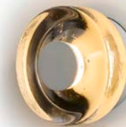
Crystal/Matte White TAK-PC00-GL01-SH