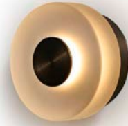
Frosted/Antique Bronze TAK-PA02-GLF1-SH