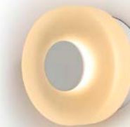
Frosted/Matte White TAK-PC00-GLF1-SH