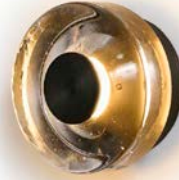
Crystal/Black Patina TAK-PA01-GL01-SH