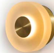
Frosted/Brushed Brass TAK-PA00-GLF1-SH