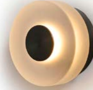
Frosted/Black Patina TAK-PA01-GLF1-SH