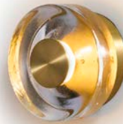
Crystal/Brushed Brass TAK-PA00-GL01-SH