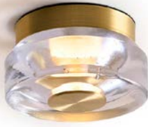
Crystal/Brushed Brass TAK-PA00-GL01-SH