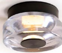
Crystal/Black Patina TAK-PA01-GL01-SH