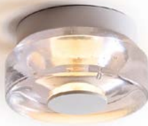
Crystal/Matte White TAK-PC00-GL01-SH