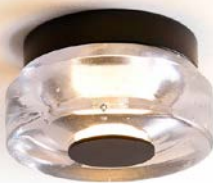
Crystal/Matte Black TAK-PC01-GL01-SH