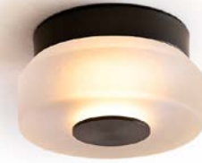
Frosted/Black Patina TAK-PA01-GLF1-SH