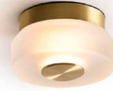
Frosted/Brushed Brass TAK-PA00-GLF1-SH