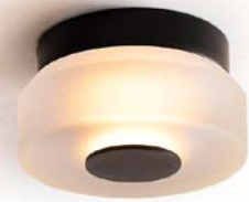
Frosted/Matte Black TAK-PC01-GLF1-SH