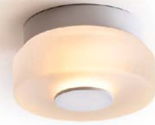
Frosted/Matte White TAK-PC00-GLF1-SH