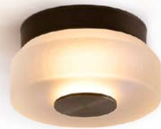
Frosted/Antique Bronze TAK-PA02-GLF1-SH