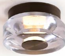
Crystal/Antique Bronze TAK-PA02-GL01-SH