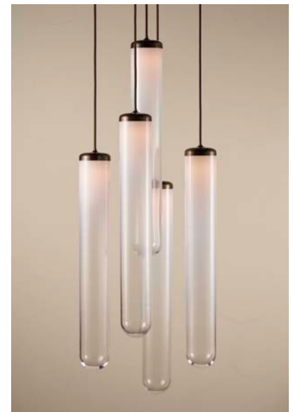
5 Light Canopy

As shown: Antique Bronze / Opaline Fade Comes with: 5 Large