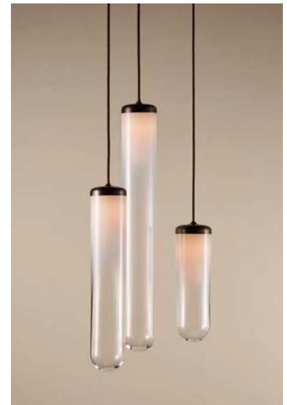
3 Light Canopy

As shown: Antique Bronze / Opaline Fade Comes with: 1 Small, 1 Medium, 1 Large