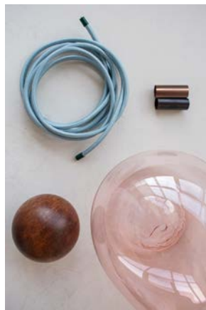
Rose Glass / Black Patina Body / Raw Copper Patina Shade / Shale Cord ONT-PS01-GL09-C06-S2