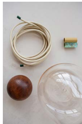
Sand Glass / Verdigris Body / Tan Powder Coat Shade / Ivory Cord ONT-PS02-GL11-C05-S2