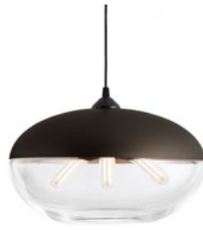
Dark Bronze/Crystal POR-101