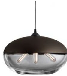
Dark Bronze/Smoke POR-105