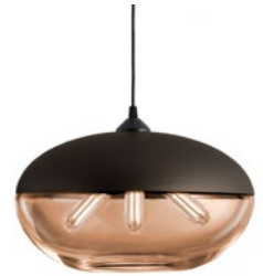
Dark Bronze/Tea POR-106