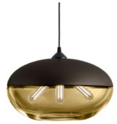
Dark Bronze/Bronze POR-103