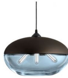
Dark Bronze/Sapphire POR-102