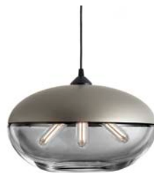
White Gold/Smoke POR-205