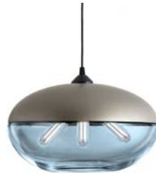
White Gold/Sapphire POR-202