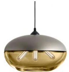
White Gold/Bronze POR-203