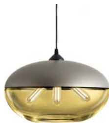
White Gold/Olive POR-204