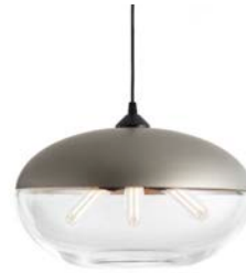
White Gold/Crystal POR-201