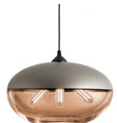
White Gold/Tea POR-206