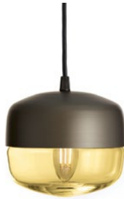
Dark Bronze/Olive PCR-104