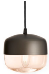
Dark Bronze/Tea PCR-106