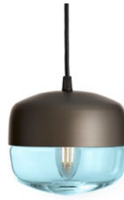
Dark Bronze/Sapphire PCR-102