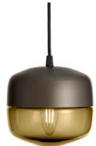
Dark Bronze/Bronze PCR-103