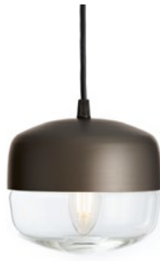
Dark Bronze/Crystal PCR-101