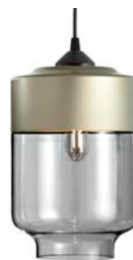
White Gold/Smoke PCA-205