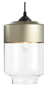
White Gold/Crystal PCA-201