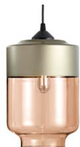
White Gold/Tea PCA-206