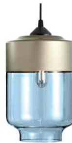
White Gold/Sapphire PCA-202