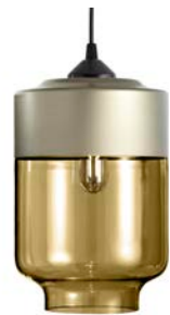
White Gold/Bronze PCA-203