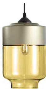
White Gold/Olive PCA-204