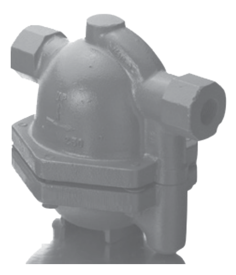
Figure 1. NFT250 Series Steam Trap

NFT250 Series are float and thermostatic steam traps. Float is free of levers, linkages or other mechanical connections. This float is weighted to maintain orientation and acts as the valve being free to modulate condensate through the seat ring. Air vent is balanced-pressure design with stainless steel welded