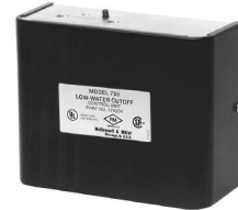
Series 750 Control Unit