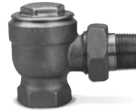
Model 9C Angle 1" NPT