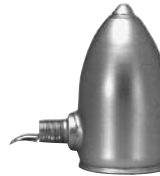
Air Valve Model 40