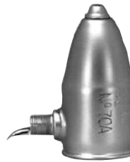
Air Valve Model 70A