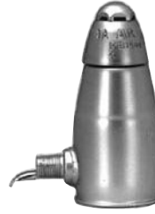
Air Valve Model 1A