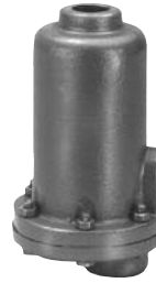
Drain Valve Model 793