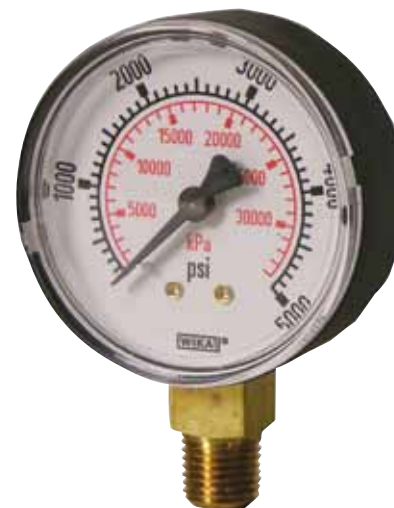
Bourdon Tube Pressure Gauge Type 111.10

Additional error when temperature changes from reference temperature of 68°F (20°C) ±0.4% of span for every 18°F (10°K) rising or falling.