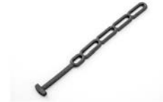
33300041 EPDM Rubber Strap