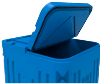
NEW Split-Lid option available on both PB1545 & PB2145