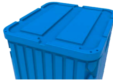
NEW Stackable Lid option available on both PB1545 & PB2145