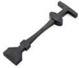
35500079 EPDM Rubber T Strap