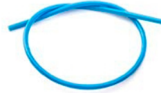
33300043 Nylon Cord