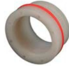
34100566 2" Male, 1.5" Female NPT Adapter