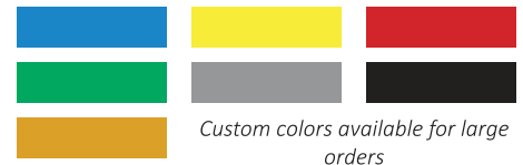
Custom colors available for large orders