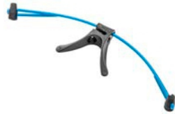
34702501 Y-Clip/Nylon Cord/ Adjustment Plugs