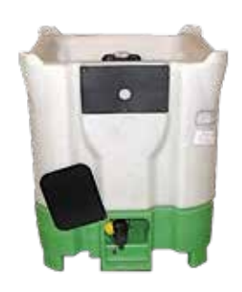
RAZ 454 454 Liters, 120 Gals.