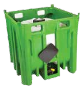
Co-Pack 454 Liters, 120 Gals.