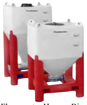
Flowmaster Hopper Bins 45° and 60° bottom