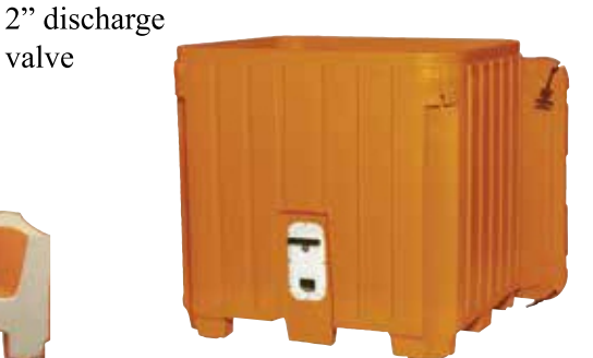
Bag in Box BIB1645