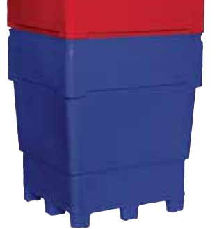
MB 2951-4 way base