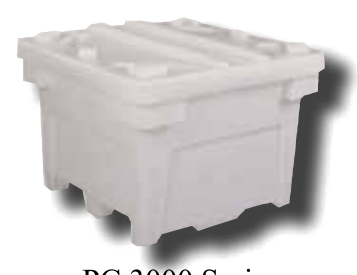
PC 3000 Series