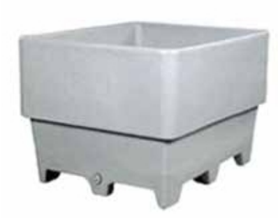
PC 7010 Double Wall 50 x 42" x 36" 30 cubic foot capacity