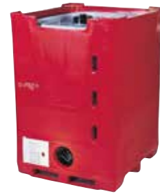
PRO-KUBE® Triple Wall 1249 Liters, 330 Gals.