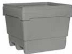
MB 2836 - 2 way base