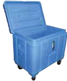
PB 11 DXX 11 Cubic Feet