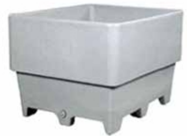
PC 7010 Double Wall 50 x 42" x 36" 30 cubic foot capacity