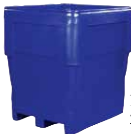
PC 1110 series 2 way base