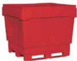
MB 2936 Roll-over base