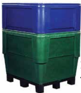
PC 1140 series 4 way base