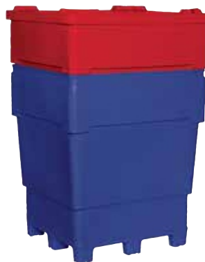
MB 2951- 4 way base