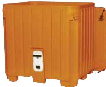
Bag in Box BIB1645