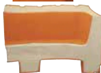
Polyurethane Foam Insulation