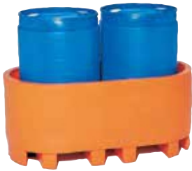
Spill Containment 1-4 Drum Capacity