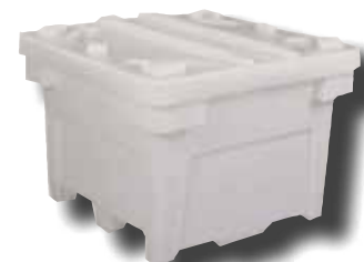
PC 3000 Series