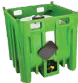
Co-Pack 454 Liters, 120 Gals.