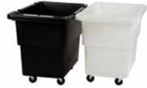
Dura Cart 11-16 cubic feet 800 lb. Capacity