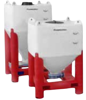
Flowmaster Hopper Bins 45° and 60° bottom