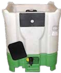
RAZ 454 454 Liters, 120 Gals.