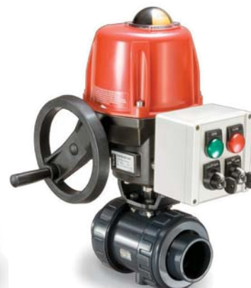
V Series Electric with Local Control Station