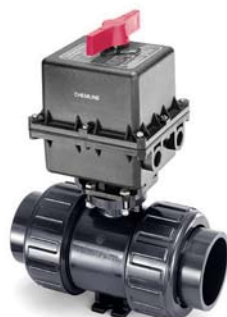
Q Series Electric