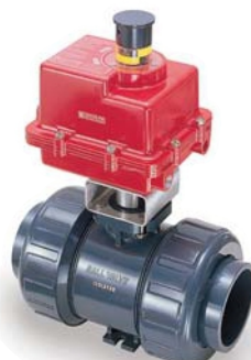
A Series Electric