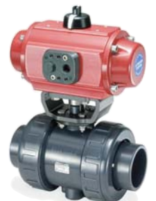
PA Series Pneumatic