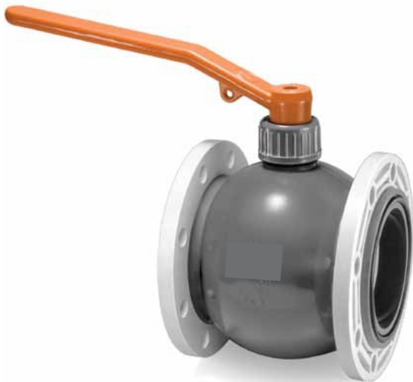
4" & 6" Sizes

SL Series Cavity Free Ball Valves are molded-in-place full port 1/2" to 6", available in PVC and PP with a polyethylene ball. The 6" size is a full port alternative to a 4" ball valve with ends increased to 6".