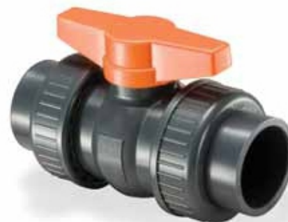
1/2" to 2" Sizes