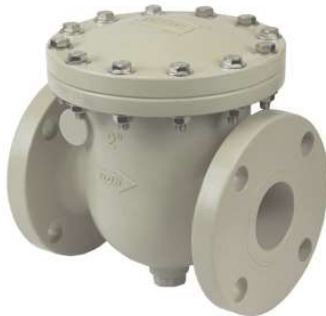
Bolted Bonnet on Sizes 1-1/2" & Up

All Valves Assembled with Silicone-Free Lubricants