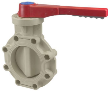
Lever Handle Style

Pressure Rating @ 73°F (23°C), Water 1-1/2" - 12" 150 psi