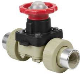
PP Thread Style

Maximum Service Temperature PP = 180°F (82°C)