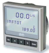
Type M9.00, .02 Flow Monitor/Transmitters