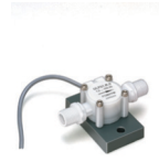
Type ULF Ultra Low Flow Sensors