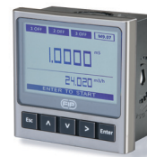
Type M9.07 Dual Parameter Conductivity and Flow Monitor and Transmitter