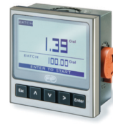
Type M9.50 Batch Controller