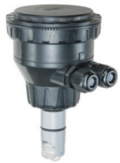
Type F6.30 Blind Transmitters