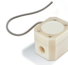
Type F3.80 Oval Gear Flow Sensors