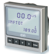
Type M9.20 Battery Powered Flow Monitor