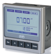
Type M9.06 pH/ORP Monitor