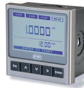
Type M9.05 Conductivity Monitor