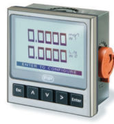
Type M9.10, M9.03 Flow Monitor/Transmitter