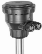
Type F6.60M Electromagnetic Flow Transmitters