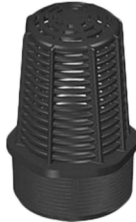
PE Black Threaded Only