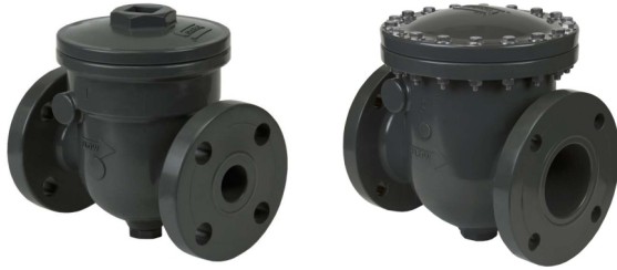
Threaded Bonnet on Sizes 3/4", 1" & 1-1/4" Bolted Bonnet on Sizes 1-1/2" & Up (Valve Shown with Arrow Indicator Option)

Pressure Rating @ 73°F (23°C), Water 3/4" - 4" 150 psi 6" 100 psi 8" 70 psi