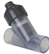
PVC Clear — Socket Style