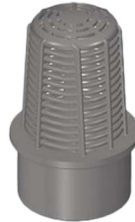
PVC Gray Spigot Or Threaded