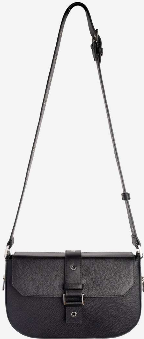
MINI BRUTE BAG $350