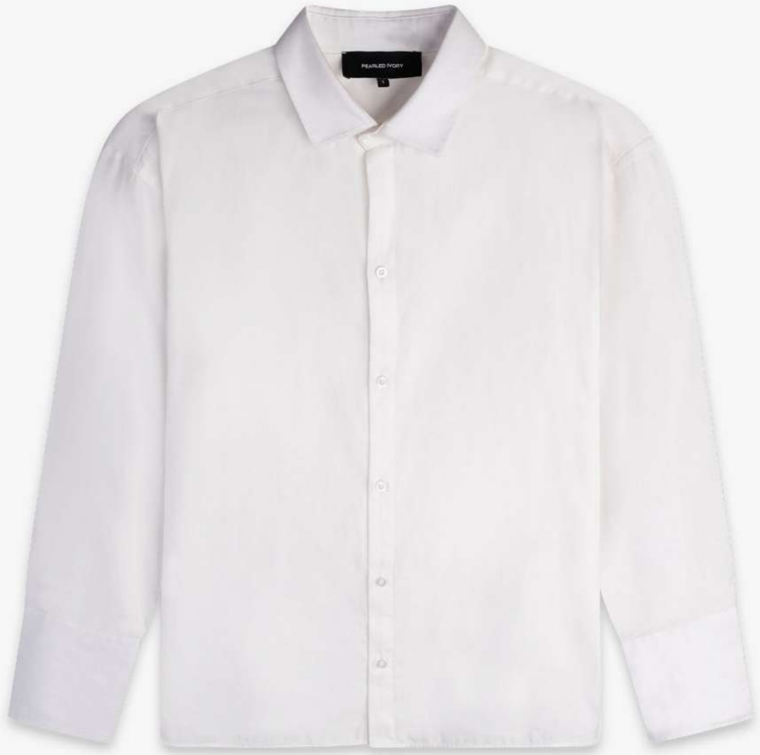
SEBASTIAN BUTTON SHIRT $138