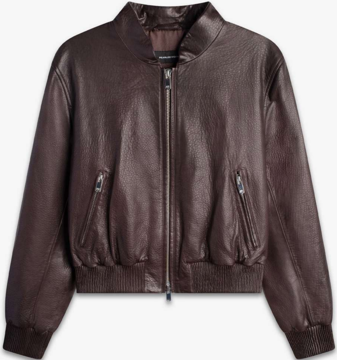
CHOCOLATE BOMBER JACKET $595