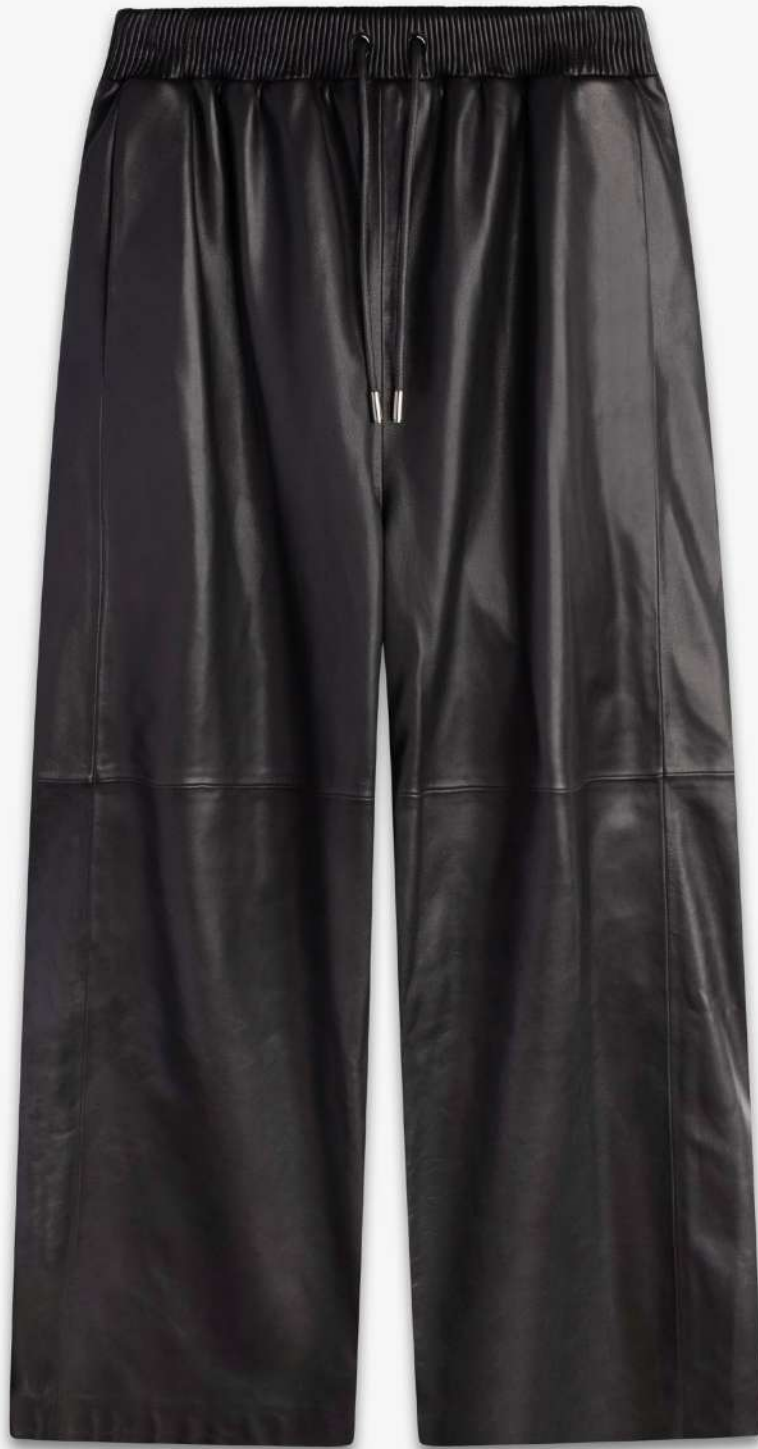
LEATHER LOUNGE PANT