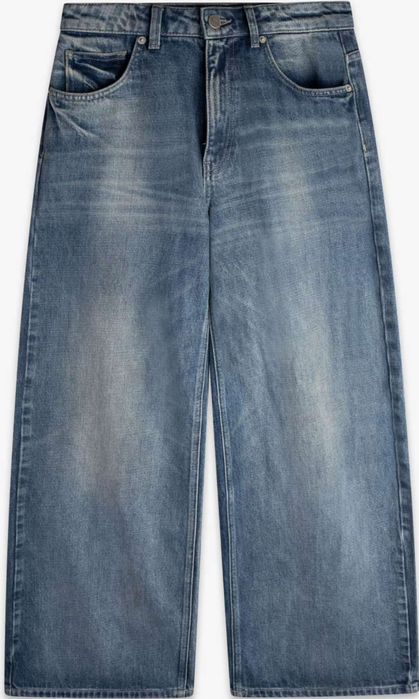
PI1211 DENIM $210