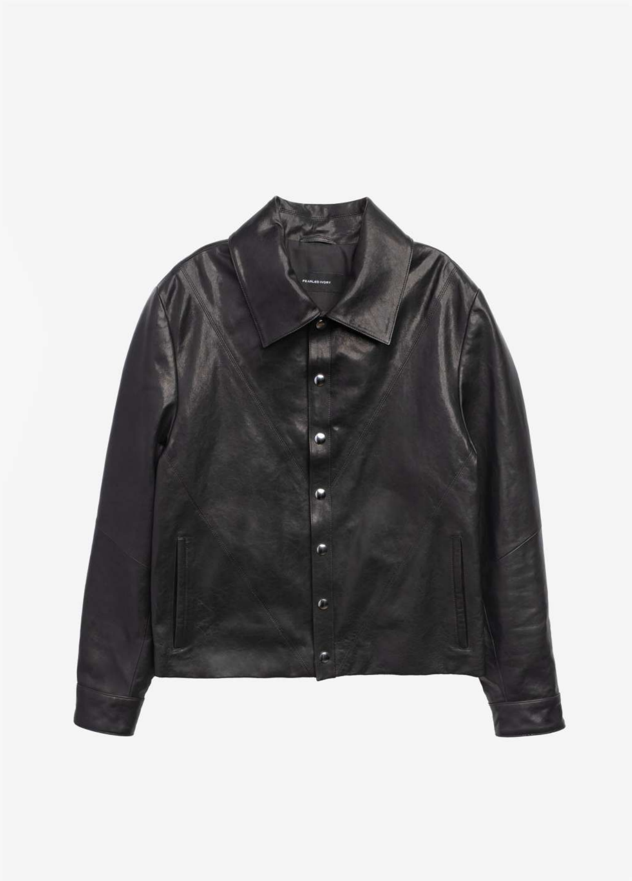
SNAP JACKET $595