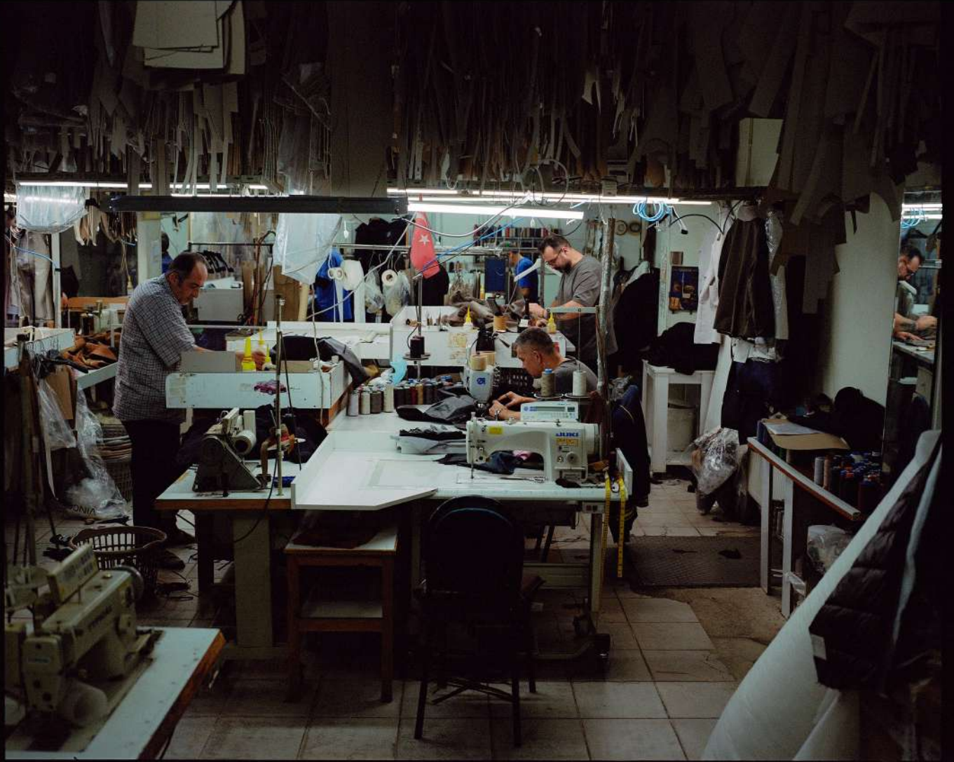
A NIGHT ON THE MARMARAY