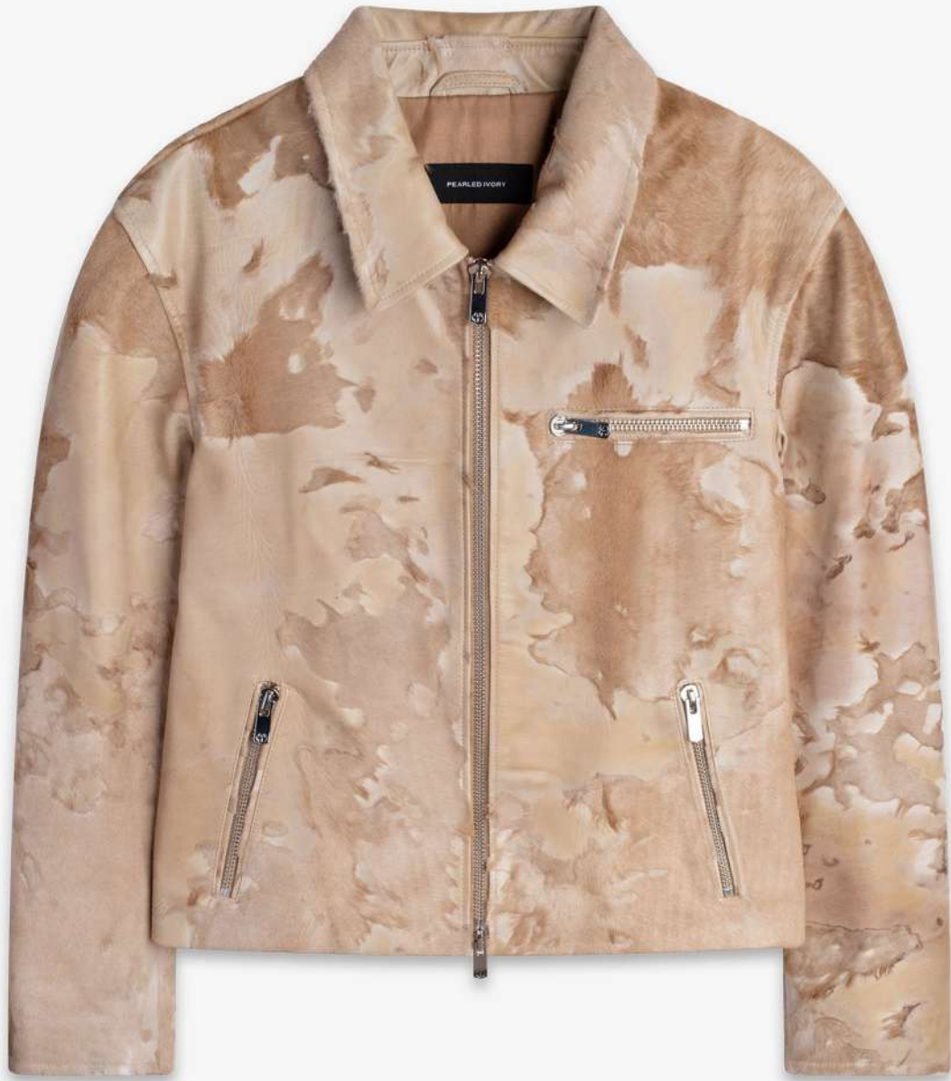
HYDE JACKET $720