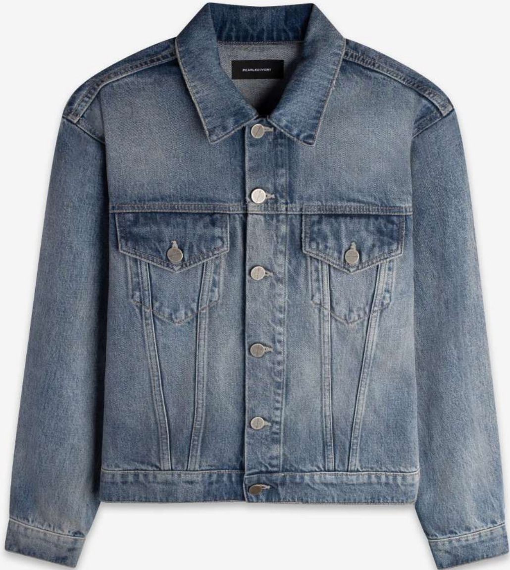
DENIM TRUCKER JACKET $252