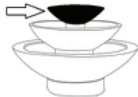
FT-131A (28 lbs) 18"W x 4.5"H

Step 8 - Center the middle bowl (FT-131B) over the pump house (FT-131C).