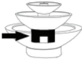
FT-131C (25 lbs) 11.5"W x 7"H

Note: Using the handle of a screwdriver or hammer works best to press the stopper in place.