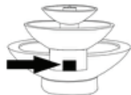
FT-131D (2 lbs) 5"L x 1.5"W x 4.75"H

Step 10 - Center the top bowl (FT-131A) over the middle bowl (FT-131B).