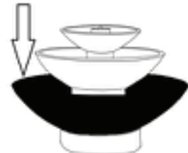
P-502 (198 lbs) 39.5"W x 9.75"H

Step 1 - Place the base (FT-131F) into position where the fountain will be installed, ensuring that it is level.