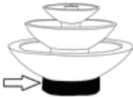
FT-131F (50 lbs) 18"W x 4.5"H

Three people are recommended for the installation of this fountain!