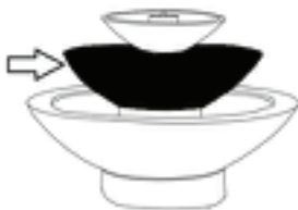
FT-131B (113 lbs) 29.25"W x 8"H

Step 6 - Place the pump house (FT-131C) over the pump and in the center of the Zen Bowl (P-502).