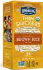
Organic Salt-Free Brown Rice Thin Stackers®