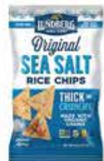
6oz Sea Salt Rice Chips