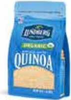
Organic Antique White