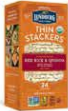
Organic Red Rice & Quinoa Thin Stackers®