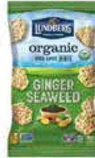
5oz Organic Ginger Seaweed Rice Cake Minis