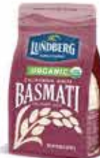
Organic California White Basmati