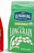
Organic Long Grain White