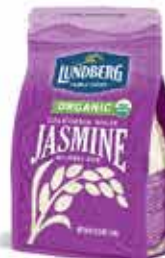
Organic California White Jasmine

Products are in ranking order from left to right within each product line.