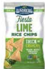
6oz Fiesta Lime Rice Chips