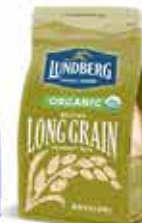
Organic Long Grain Brown