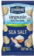
5oz Organic Sea Salt Rice Cake Minis