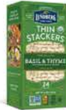
Organic Basil & Thyme Thin Stackers®