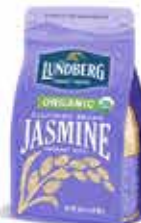
Organic California Brown Jasmine