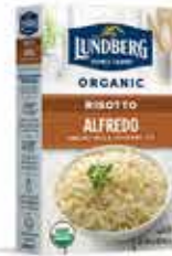
Organic Alfredo Risotto