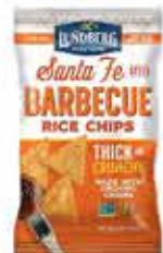
6oz Santa Fe Barbecue Rice Chips