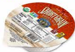
Organic Short Grain Brown Rice Bowl