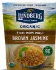
Organic Brown Thai Hom Mali Jasmine