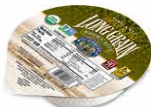
Organic Long Grain Brown Rice Bowl