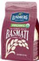
Organic California White Basmati