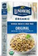
Organic Original Whole Grain & Wild Rice