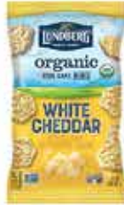
5oz Organic White Cheddar Rice Cake Minis