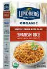
Organic Spanish Rice Whole Grain Rice Pilaf