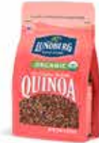
Organic Tri-Color Blend