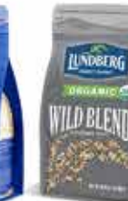
Organic Wild Blend*