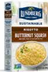
Butternut Squash Risotto