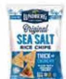
1.5oz Sea Salt Rice Chips