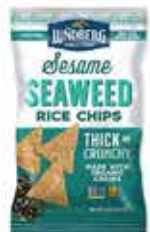
6oz Sesame Seaweed Rice Chips