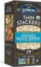
Organic Cracked Black Pepper Thin Stackers®