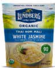
Organic White Thai Hom Mali Jasmine