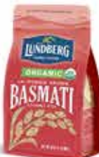
Organic California Brown Basmati