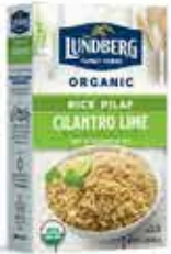
Organic Cilantro Lime Rice Pilaf