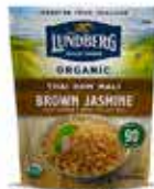
Organic Brown Thai Hom Mali Jasmine