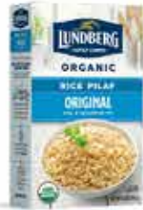
Organic Original Rice Pilaf