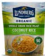
Organic Whole Grain Rice Pilaf Coconut Rice