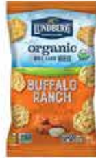
5oz Organic Buffalo Ranch Rice Cake Minis