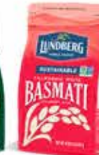
California White Basmati