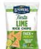
1.5oz Fiesta Lime Rice Chips