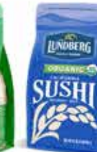
Organic California Sushi