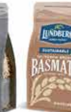
California Brown Basmati