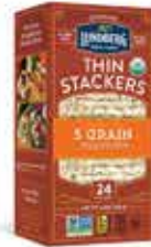
Organic 5 Grain Thin Stackers®