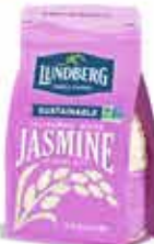
California White Jasmine