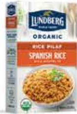
Organic Spanish Rice Pilaf