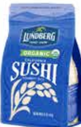
Organic California Sushi