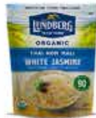
Organic White Thai Hom Mali Jasmine