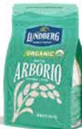
Organic White Arborio