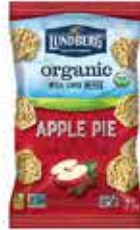
5oz Organic Apple Pie Rice Cake Minis