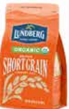
Organic Short Grain Brown