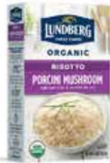
Organic Porcini Mushroom Risotto