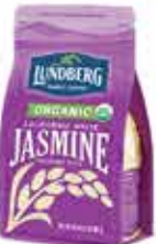
Organic California White Jasmine