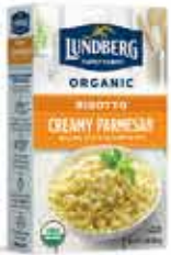
Organic Creamy Parmesan Risotto