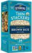
Organic Lightly Salted Brown Rice Thin Stackers®