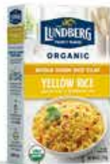
Organic Yellow Rice Whole Grain Rice Pilaf