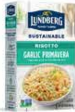
Garlic Primavera Risotto