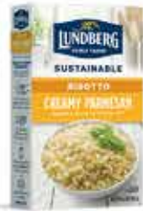
Creamy Parmesan Risotto