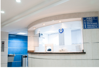
Reception Clinical Room