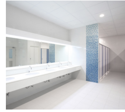
Public Washroom Retail