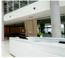
Reception Area Clinical Room