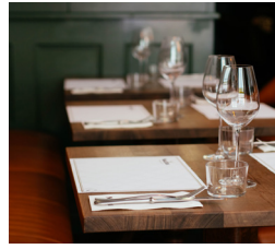
Restaurant Commercial Kitchen