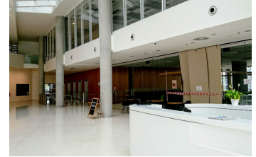
Unoccupied public spaces