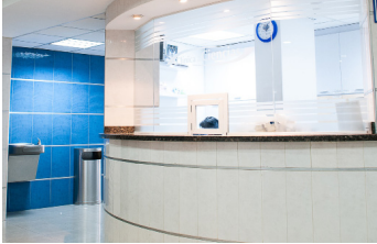
Clinics after hours

Galax Surface-02 is suitable for unoccupied spaces such as: