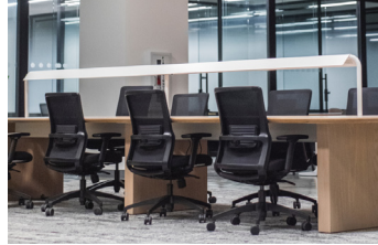
Offices after hours