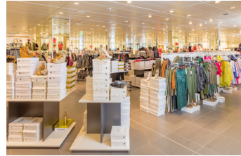
Shopping Malls after hours