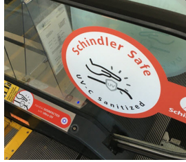
San Jose International Airport