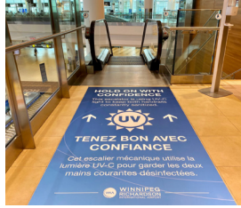
Winnipeg Richardson International Airport