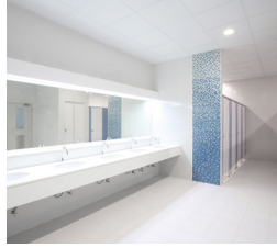
Public Washroom Elevator